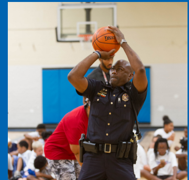
Support for the Police Athletic League's Midnight Basketball and a special basketball clinic.