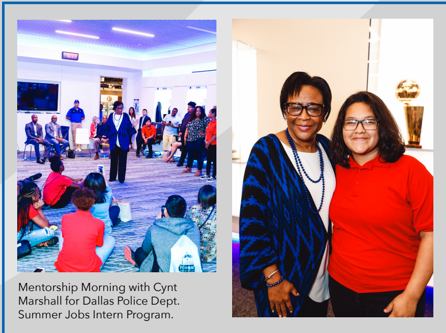
Mentorship Morning with Cynt Marshall for Dallas Police Dept. Summer Jobs Intern Program.