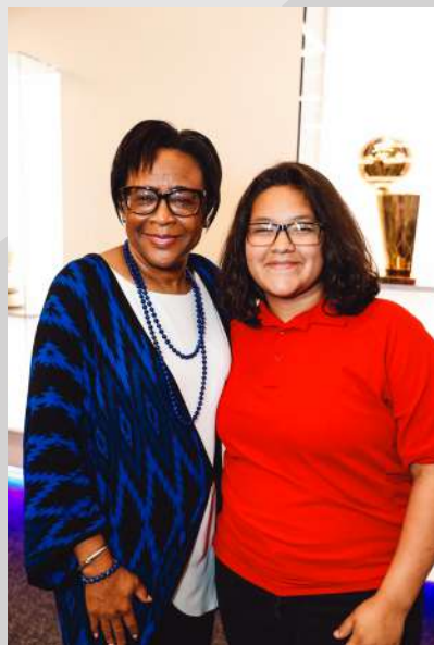
Support for the Police Athletic League's Midnight Basketball and a special basketball clinic.