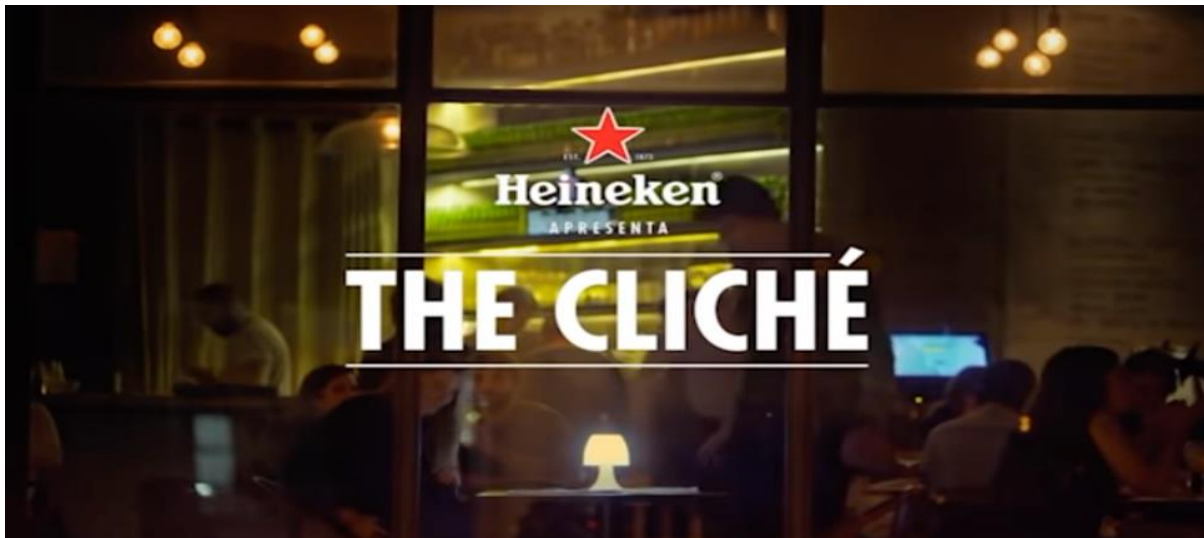
Figure 8: Heineken ad “The Cliché”