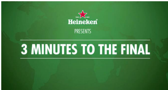
Figure 6: Heineken ad “What would you do to...”

From Heineken: Cómo conseguir una entrada para final de la Champions (cameo de Iván Zamorano) , 2014. El blog de marketing online de carlos saldaña. https://blog-de-marketing-online.com/heineken-como-conseguir-una-entrada-para-final-de-la-champions-cameo-de-ivan-zamorano/