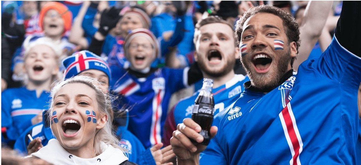
Figure 11: Russian people supporting the national football team (scene from the Coca-Cola ad)