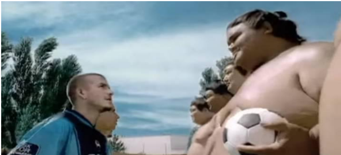
Figure 13: David Beckham facing a sumo in a Pepsi ad

From The 'Sumo' Pepsi Advert Starring David Beckham Is An Absolute Classic , 2018. Sportsible. https://www.sportbible.com/football/news-take-a-bow-funny-the-sumo-pepsi-advert-starring-david-beckham-is-the-greatest-ever-20180829