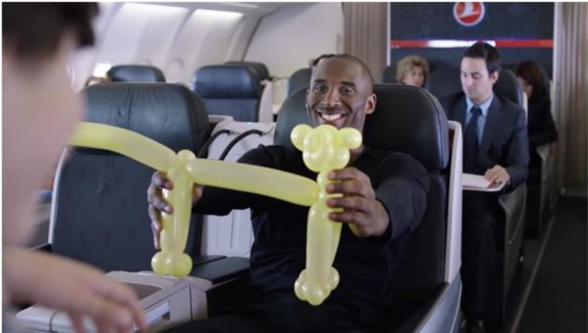
Figure 21: Koby Bryant for a Turkish Airlines campaign

Retrieved on 2021 from https://www.youtube.com/watch?v=YXmsgufQ6oM Screenshot by author