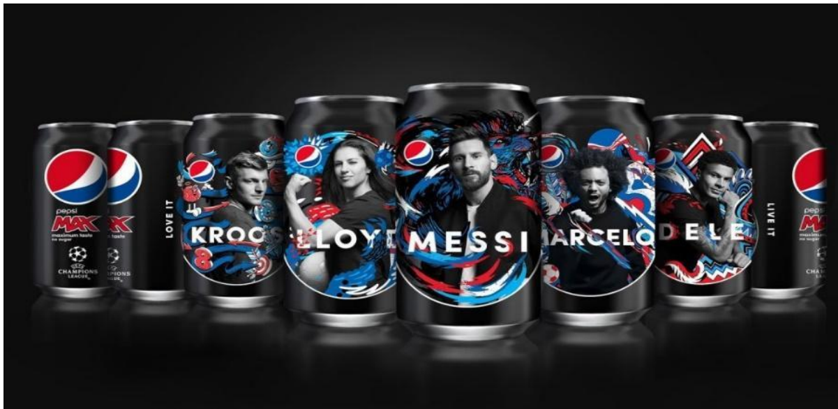
Figure 12: Famous football players on Pepsi cans

From The Best Pepsi Football Commercials , 2019. Bannerad design. https://bannerad-design.com/the-best-pepsi-football-commercials/