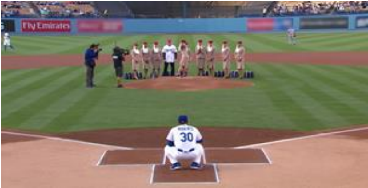
Figure 20: Baseball players and flight attendants giving a demonstration at a football stadium for Emirates campaign