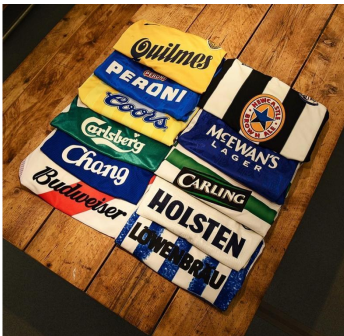
Figure 1: Brand logos displayed on football shirts