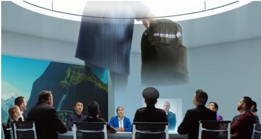
Figure 23: People “at a business meeting” in a Qatar Airways commercial