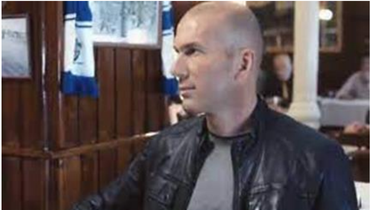
Figure 16: Zinadine Zidane at Visa advertising

Retrieved 2021 from https://www.youtube.com/watch?v=rK9yIleifuo Screenshot by author.