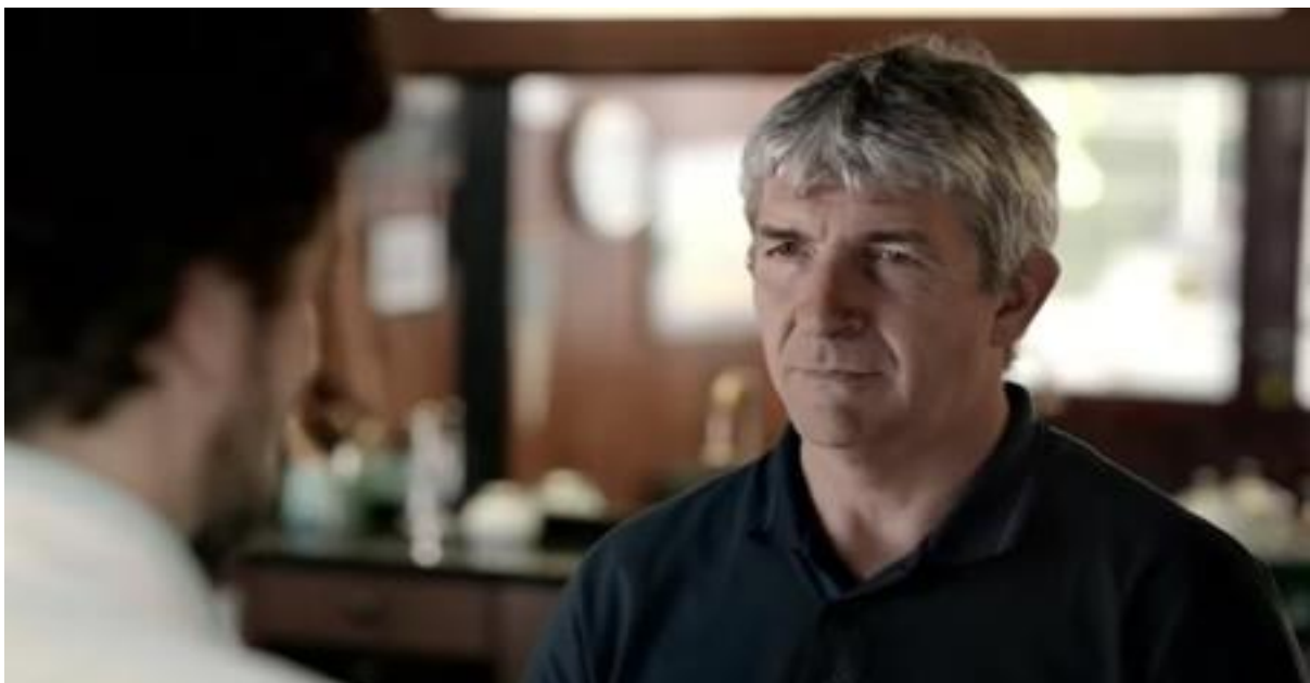
Figure 15: Paolo Rossi at Visa advertising

Retrieved 2021 from https://www.youtube.com/watch?v=6WnKfwYzL8g Screenshot by author.