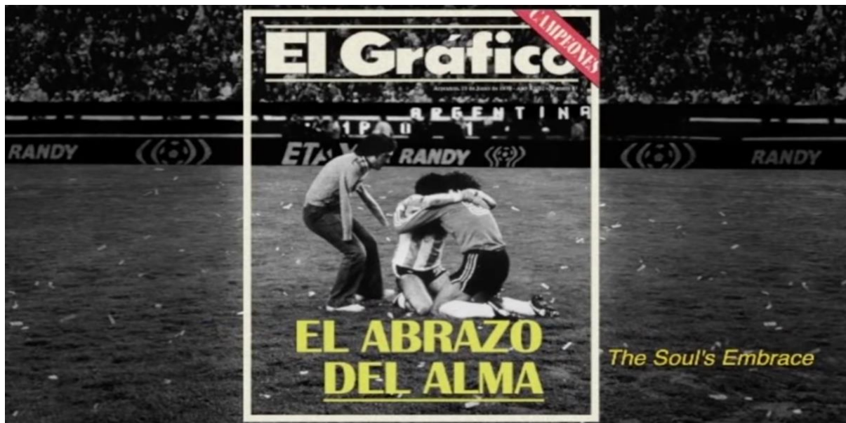
Figure 9: Coca-Cola ad “The Soul’s Embrace”

Retrieved in 2021. https://www.youtube.com/watch?v=zT9fIBWP3FQ Screenshot by author.