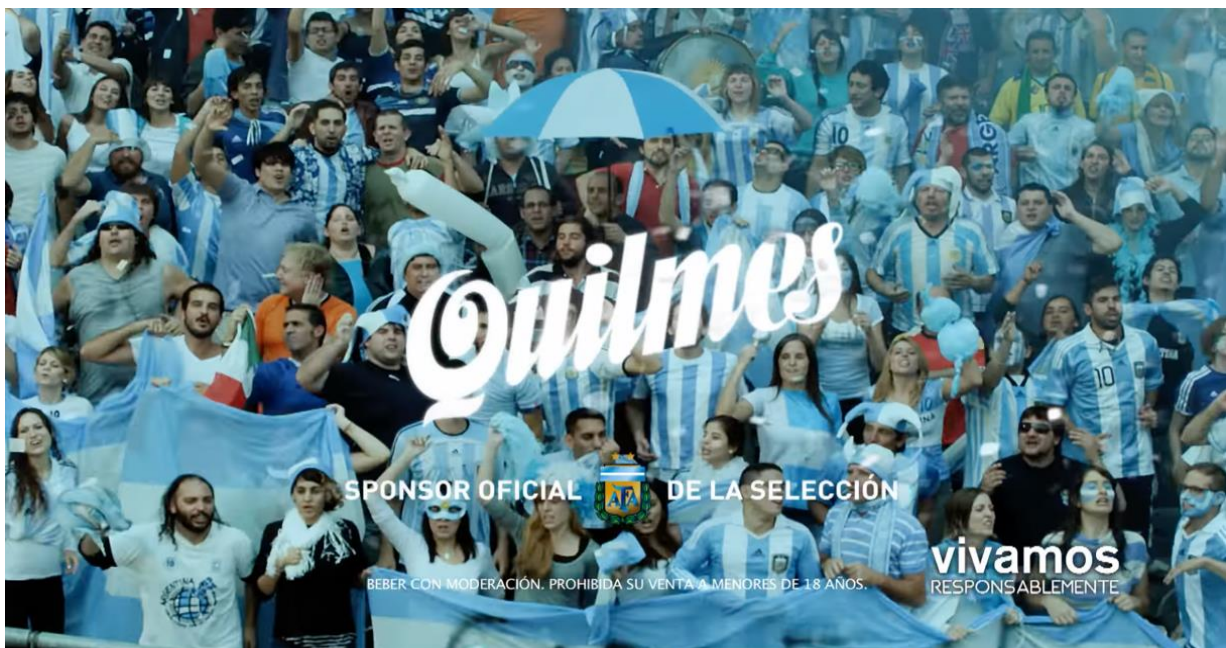
Figure 4: People supporting Argentina's football team

From Cerveza Quilmes será sponsor del Club Quilmes de por vida , 2019. Brands & Marketing. https://stevoglutu.com/b03_VQ0RP.2ShT0-YVXWRXiYP_TaEbmccdn-JfpgZhDi0_zkZlWmUnw-MpDqlrjsN_zudvkwNxj-BzkAMB2CU_OENFzGEHw-ZJDKBLkMY_mOYP4QYRj-hTjUYVmWR_mYYZiaZby-cd3eJfjgP_Wihjpkcl3-Rnvocpnql_isYtWuNvr-JxnyNzJAZ_DC0D0EMFT-QHxIOJDKY_2MJNnOpPv-bRmSVTJUJZ_DW0X0YMZT-QbxcOdDeY_2g