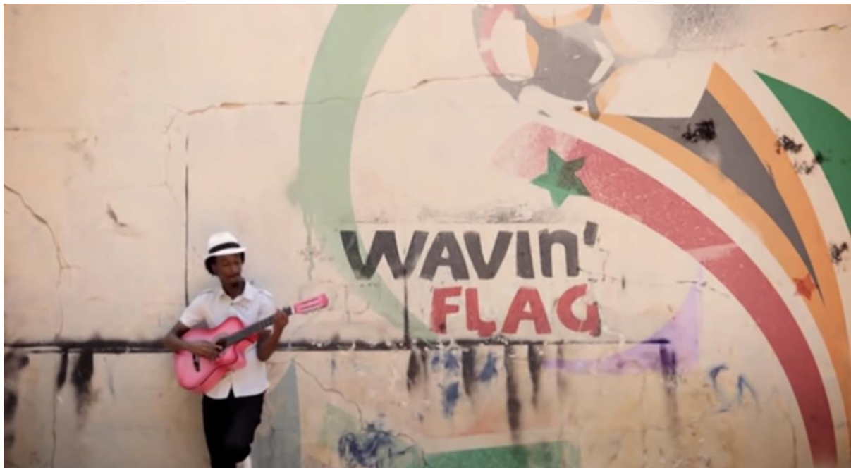
Figure 10: K'naan playing "Waving Flag"

[Online video]. Retrieved in 2021. https://www.youtube.com/watch?v=WTJSt4wP2ME Screenshot by author.