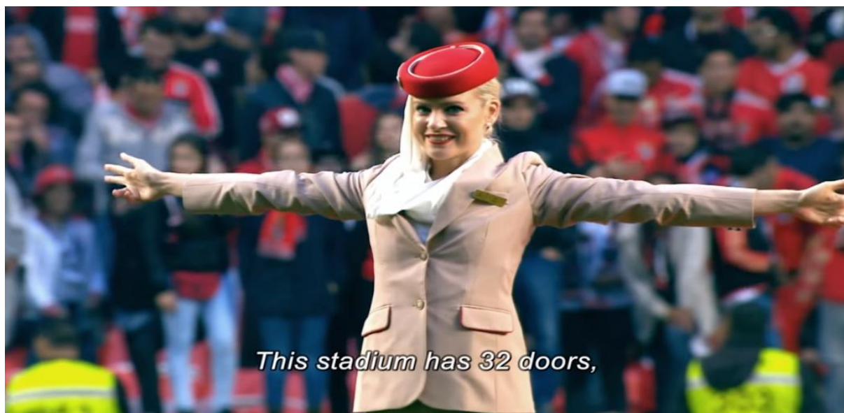
Figure 19: Flight attendant giving a demonstration at a football stadium for Emirates campaign

Retrieved in 2021 from https://www.youtube.com/watch?v=jAF2hZxdFRE Screenshot by author.