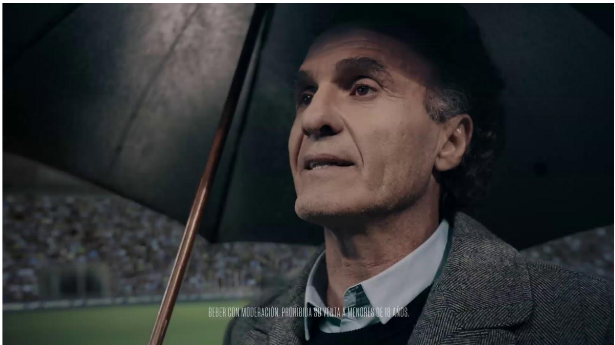
Figure 3: Oscar Ruggeri, a very famous former Argentine football player, at the Quilmes ad

Retrieved 2021 from https://www.youtube.com/watch?v=pdGNjAtdMRc . Screenshot by author.