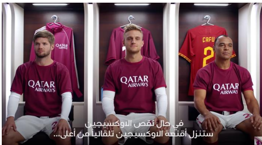
Figure 22: Famous football players in Qatar Airways commercial

Not even safety videos were immune to sponsorships and a new take on creativity, as we can see from the examples below from Qatar Airways (featuring FC Bayern Munich Robert Lewandowski, Brazil and PSG star Neymar Jr. and Brazil and AS Roma legend Cafu) and Air New Zealand (featuring Steve Hansen, Kieran Reid, Cliff Curtis and Rick Hoffman, among many others).