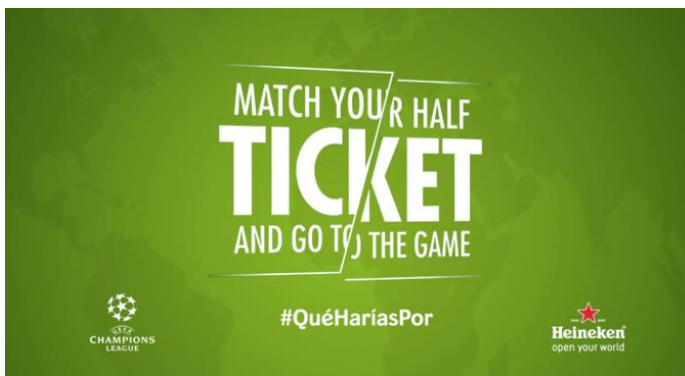
Figure 7: Heineken ad “What would you do to...”

From La prueba de Heineken para poder ver la final de la Champions League , 2014. El blog del marketing. https://www.elblogdelmarketing.com/2014/04/la-prueba-de-heineken-para-poder-ver-la.html