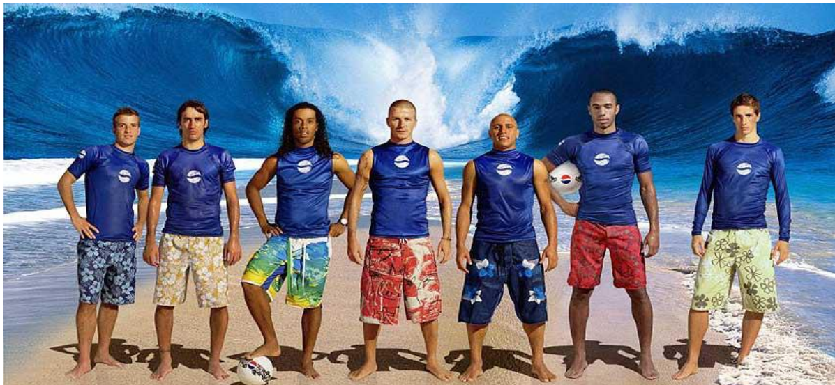
Figure 14: Famous football players posing as surfers in a Pepsi ad