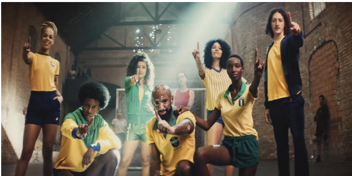
Figure 2: AB-InBev Brahma video clip

Brahma // Africa // Kill the buddha.