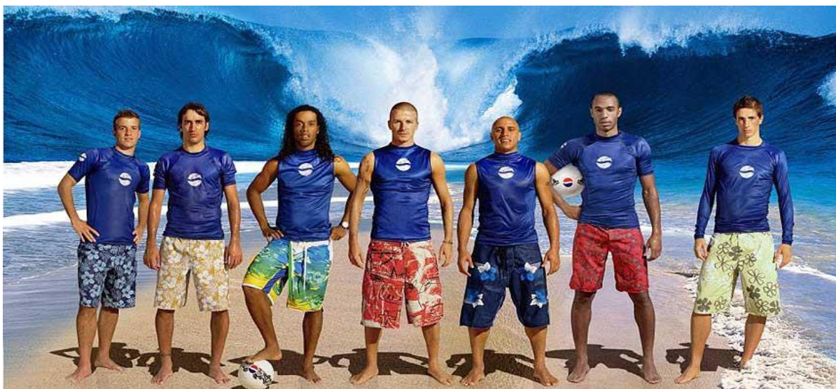
Figure 14: Famous football players posing as surfers in a Pepsi ad