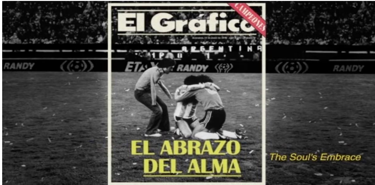
Figure 9: Coca-Cola ad "The Soul's Embrace"

Retrieved in 2021. https://www.youtube.com/watch?v=zT9fIBWP3FQ Screenshot by author.