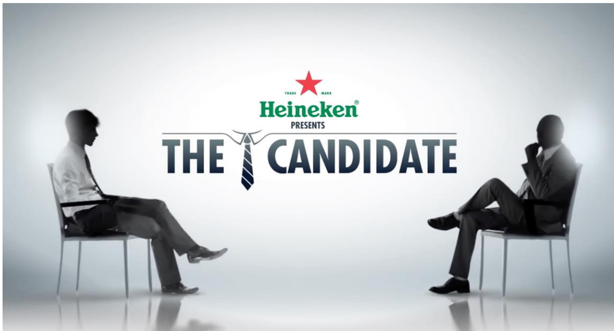
Figure 5: Heineken commercial, "The candidate"

From Case study: Heineken - The Candidate , 2013. Marketing Week. https://www.marketingweek.com/case-study-heineken-the-candidate/