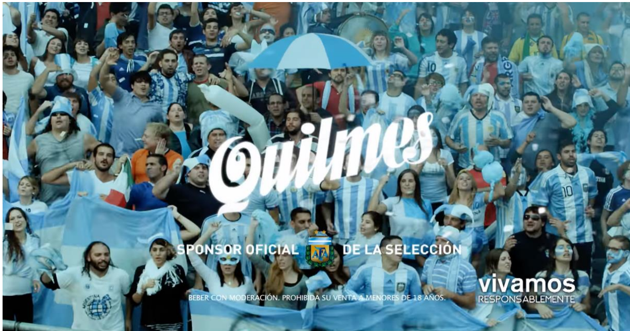
Figure 4: People supporting Argentina's football team

From Cerveza Quilmes será sponsor del Club Quilmes de por vida, 2019. Brands & Marketing.