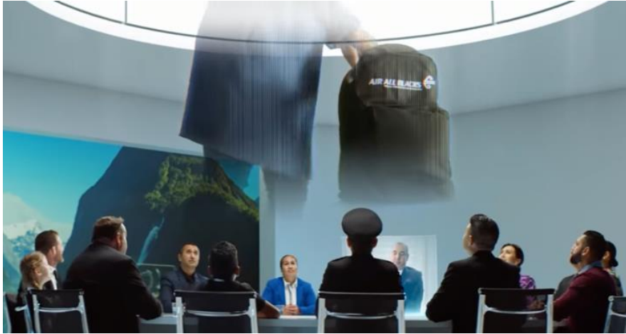
Figure 23: People "at a business meeting" in a Qatar Airways