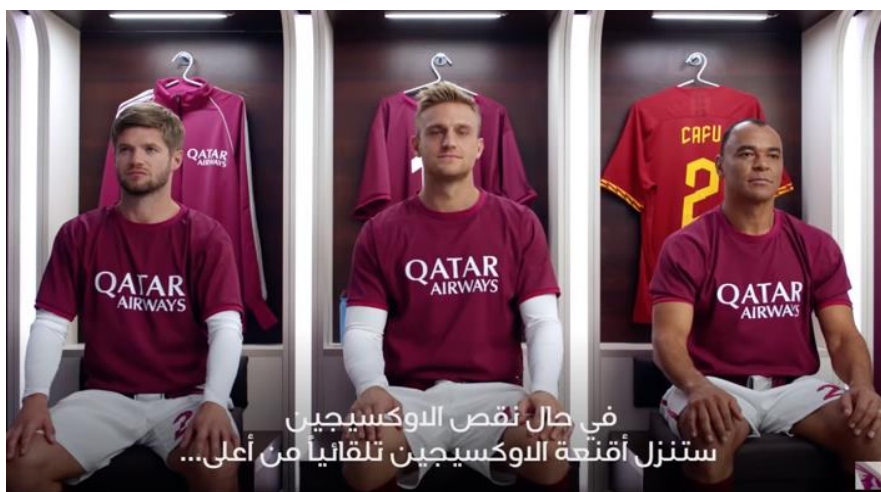
Figure 22: Famous football players in Qatar Airways commercial

Not even safety videos were immune to sponsorships and a new take on creativity, as we can see from the examples below from Qatar Airways (featuring FC Bayern Munich Robert Lewandowski, Brazil and PSG star Neymar Jr. and Brazil and AS Roma legend Cafu) and Air New Zealand (featuring Steve Hansen, Kieran Reid, Cliff Curtis and Rick Hoffman, among many others).