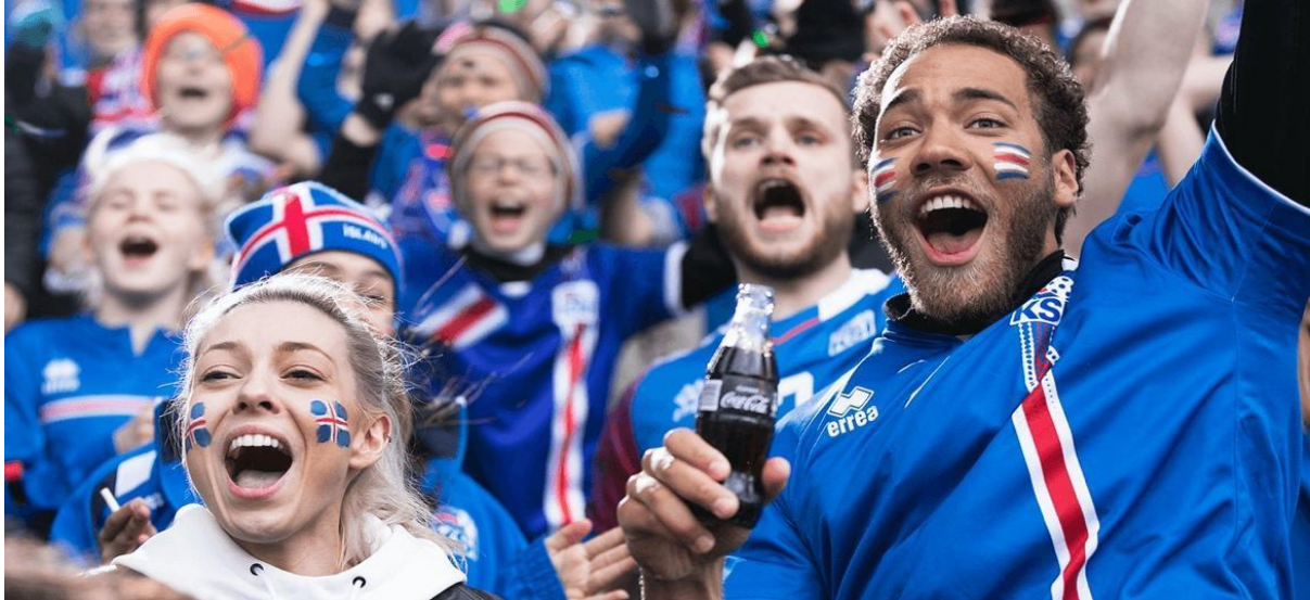
Figure 11: Russian people supporting the national football team (scene from the Coca-Cola ad)

Retrieved in 2021. https://www.youtube.com/watch?v=fdS6lVtzZdw Screenshot by author.