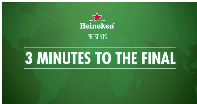
Figure 6: Heineken ad "What would you do to..."

From Heineken: Cómo conseguir una entrada para final de la Champions (cameo de Iván Zamorano) , 2014. El blog de marketing online de carlos saldaña. https://blog-de-marketing-online.com/heineken-como-conseguir-una-entrada-para-final-de-la-champions-cameo-de-ivan-zamorano/