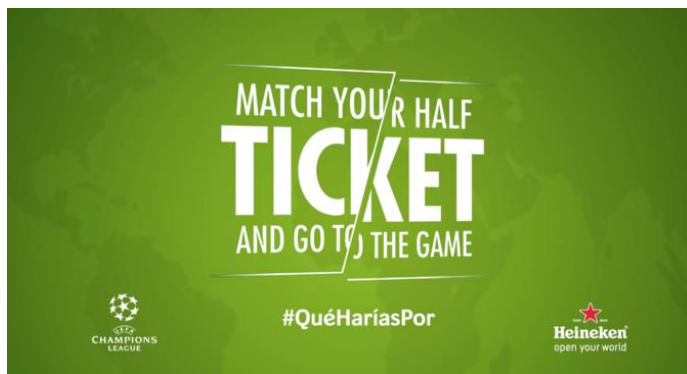
Figure 7: Heineken ad "What would you do to..."

From La prueba de Heineken para poder ver la final de la Champions League , 2014. El blog del marketing. https://www.elblogdelmarketing.com/2014/04/la-prueba-de-heineken-para-poder-ver-la.html