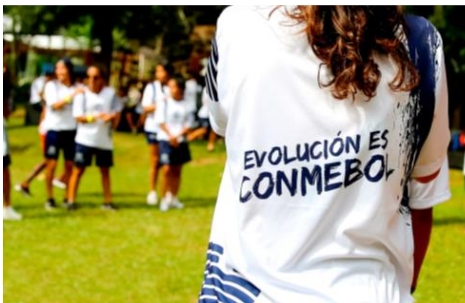
Figure 6: Evolution is CONMEBOL, representative of current football.