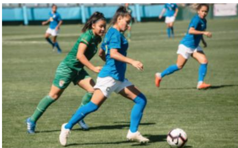
Figure 4: Competition between Two Women's Teams