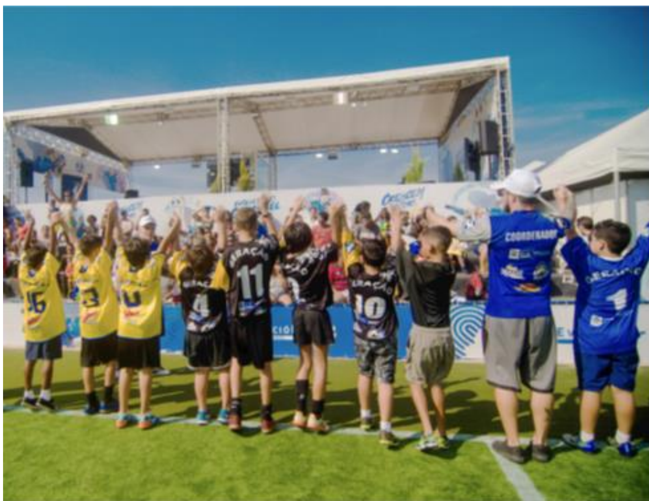
Figure 3: Children's Football Competition