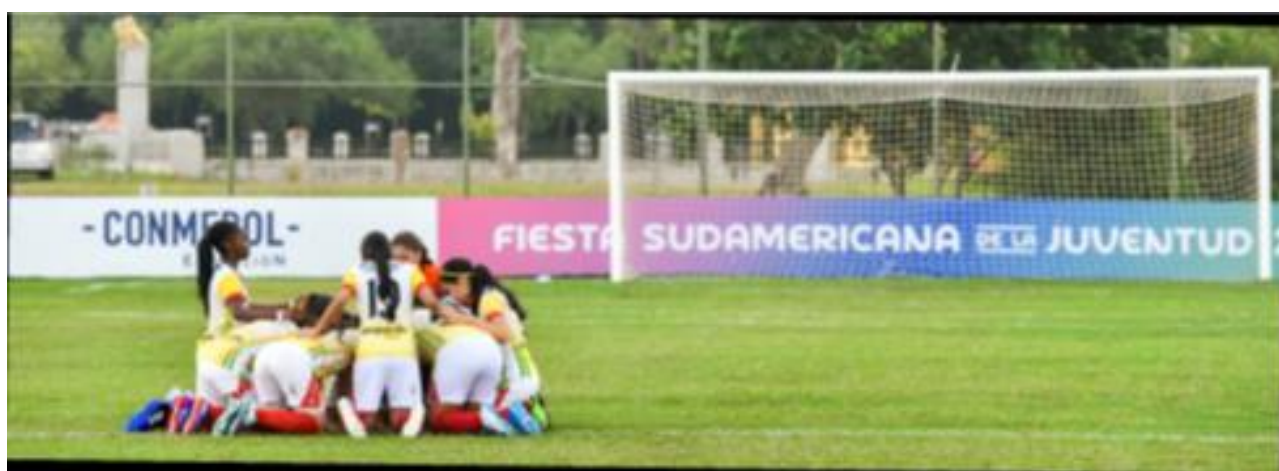
Figure 5: The Passionate Women's Team Celebrating Orderly.