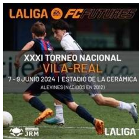
Figure 5: End of season tournament