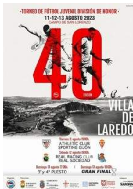
Figure 2: Preseason tournament