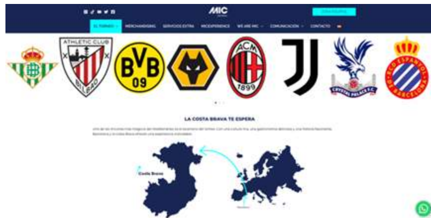
Figure 4: Easter Tournament