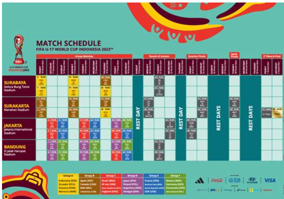
Figure 10: Example of the FIFA U17 World Cup Calendar 2023 in Indonesia