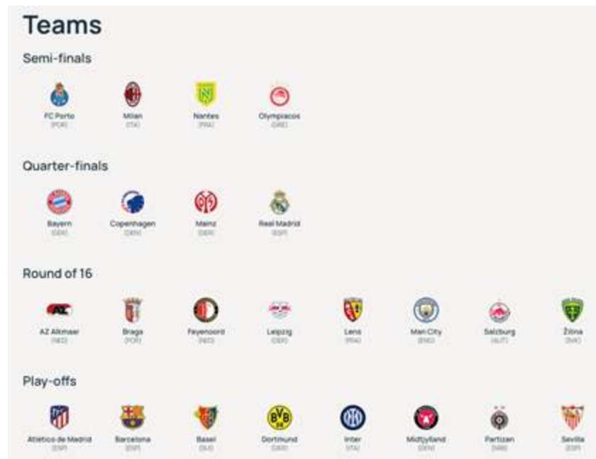
Figure 11: The 24 top-ranked teams in the UEFA Youth League 2023/2024